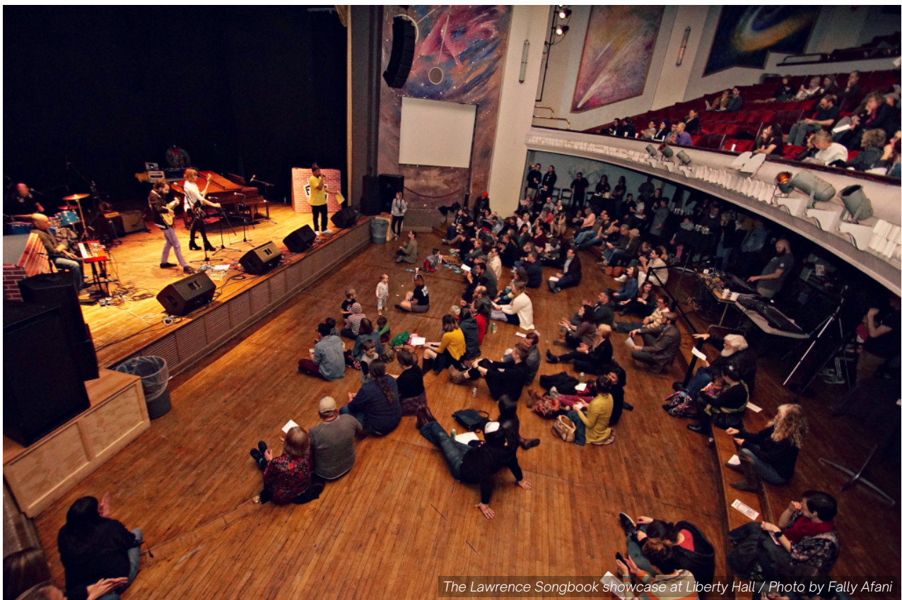
The Lawrence Songbook showcase at Liberty Hall

Of course, the Shuttered Venues Operator Grants represent the largest contributed revenue investment in music ecosystems throughout the United States. Re-energize the Kansas Venues Coalition to support their advocacy efforts, or figure out if a KS member chapter of NIVA is emergent.