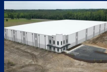
Speculative industrial office and residential space