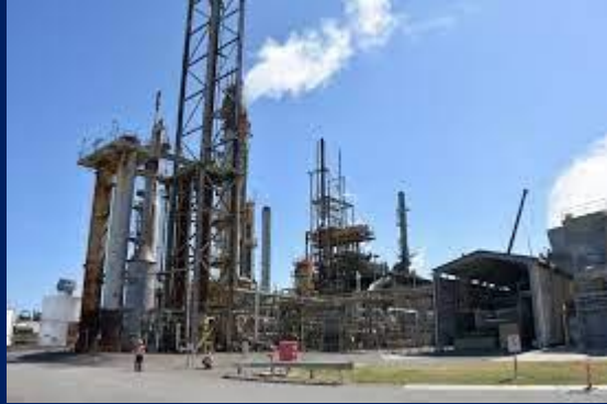
Infrastructure required to support business expansions