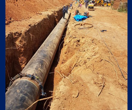
Development of infrastructure such as railroad spurs, water, wastewater, stormwater and other utilities