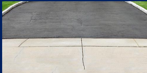
Commercial Driveway Aprons