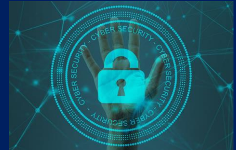
Development of infrastructure related to cybersecurity investments