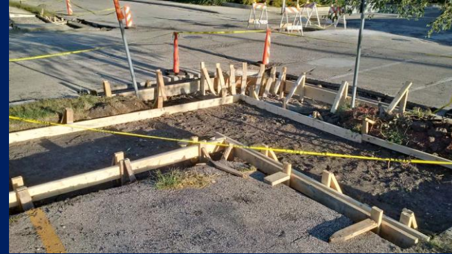
Renovation of existing business parks to bring them up to modern standards