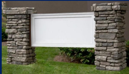
Business Park Signage