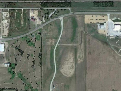
Infrastructure associated with the development of new business parks