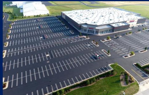
Parking facilities directly associated with business attraction projects